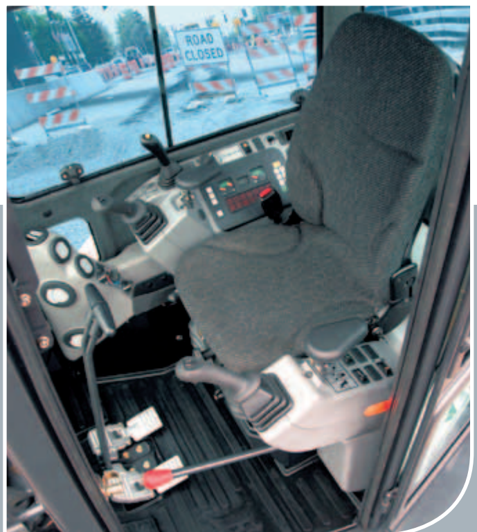
Improve your perspective with 360° visibility.