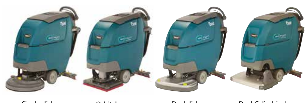
Single disk: 430 mm & 500 mm

The T300 scrubber-dryer provides multiple scrub-decks to fit your cleaning requirements and optimise cleaning performance.